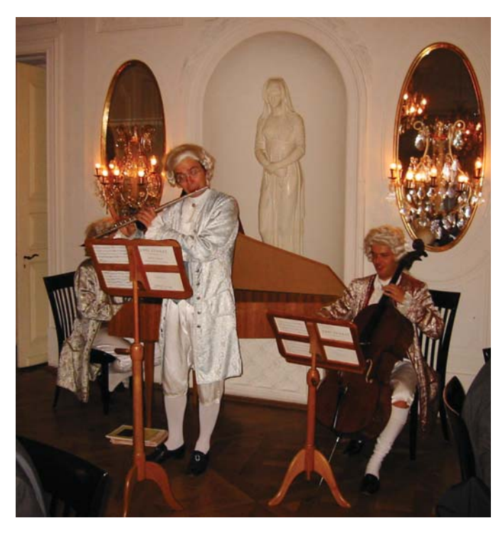
In style dinner music accompanied an excellent dinner at "Schloss Solitude"

The meeting included a conference dinner at the "Schloss Solitude". In this beautiful 17<sup>th</sup> century baroque residence an excellent dinner was served. The already great atmosphere was completed by live diner music made by a trio dressed for the occasion; see picture. The conference presentations, the lab tour and the dinner event clearly show that in Stuttgart top quality is, and has been, strived for at all times.