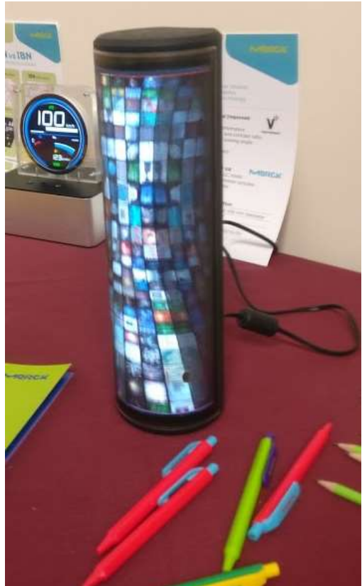
A selection of exhibits from meeting sponsors (clockwise from top-left) Merck, BOE, and FlexEnable