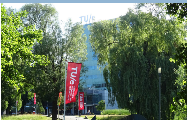
The SID-MEC meeting took place at Eindhoven University of Technology.

Special topics for this meeting were haptics for displays and smart windows based on display principles. Apart from that there was also room for 'regular' presentations about advanced displays.