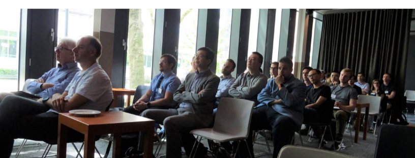
Over 50 participants from 5 different countries participated in the meeting.

More than 50 very motivated participants from 5 different countries participated in the meeting, which was also very interactive.