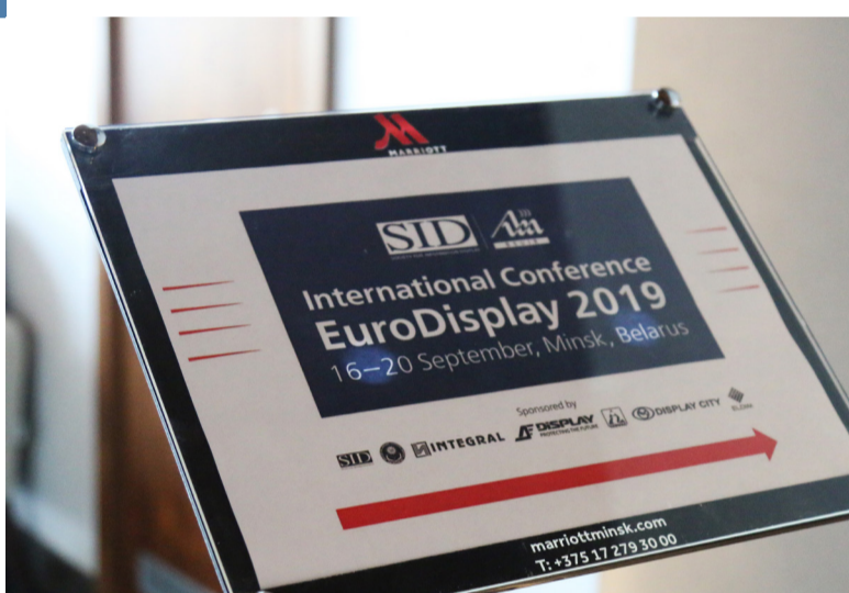
The EuroDisplay Conference was held in Minsk, Belarus.